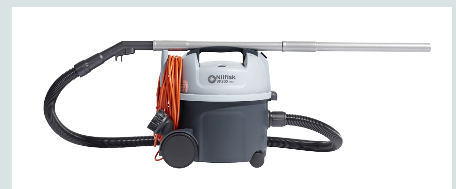
VP300 can be carried safely and comfortably in one hand