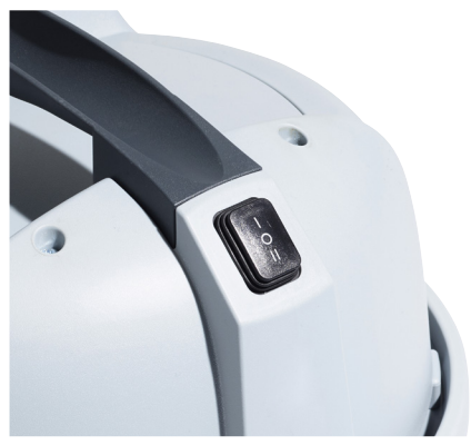
Dual speed for tailored use in a wider variety of applications