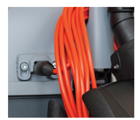
Detachable orange cord on selected variants