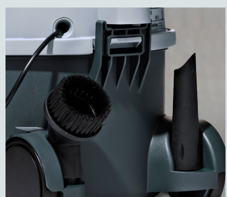
Discreet storage for nozzles allow all the tools you need to be within easy reach at all times