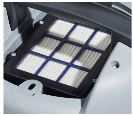
High filtration level with HEPA exhaust filter